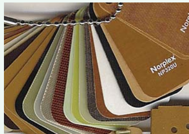
High Pressure Laminates